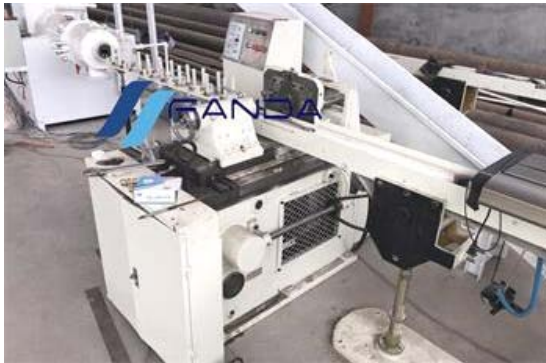
Toilet soap cutter