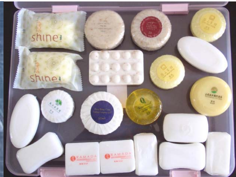
Final toilet soap