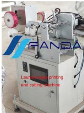
Laundry soap cutter